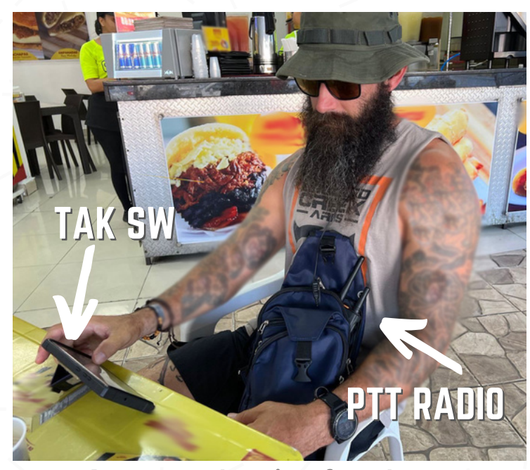
Antenna showing for photo

For information on the PTT Mesh radio, get in touch with Sovereign Systems at <a href="mailto:connect@sovsys.co">connect@sovsys.co</a> | www.sovsys.co