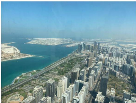
View from level 39 en route to Level 92, via level 88

For the rooftop test we decided to position the BWM30 outside, at Ground floor level, to provide connectivity from the rooftop radio to the C2 station in the Security Control room. We left the other radios in the stairwell while doing the rooftop test just to show the mesh performing across all extremes in the building.